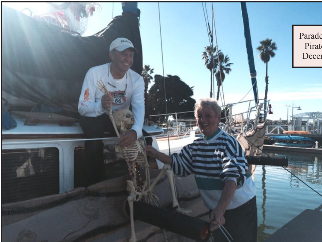
Parade of Lights Pirate Theme December 13 th