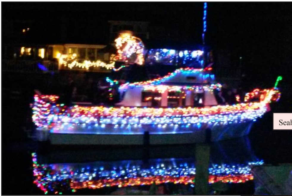
December 19th, CIYC carolers entertained the Mandalay Bay and Seabridge communities.