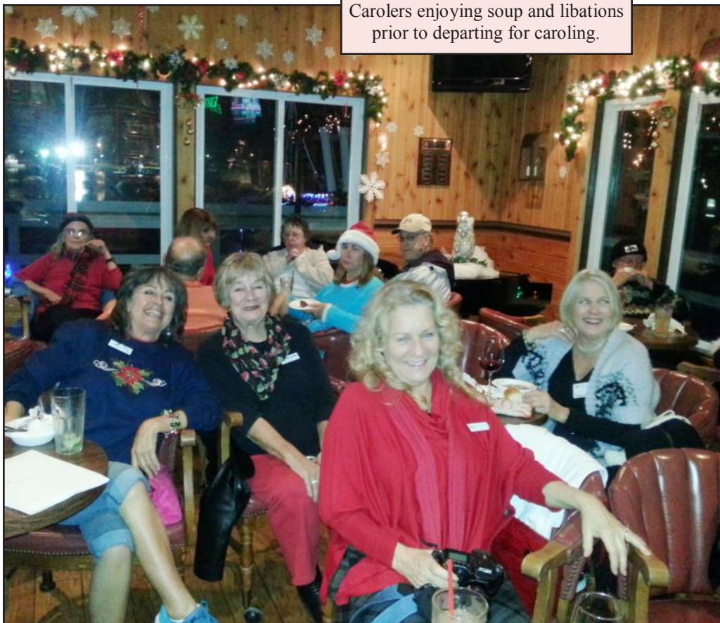
Carolers enjoying soup and libations prior to departing for caroling.