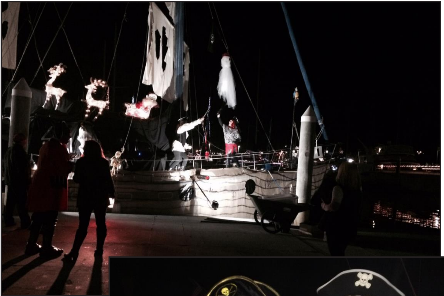
Parade of Lights Pirate Theme December 13 th