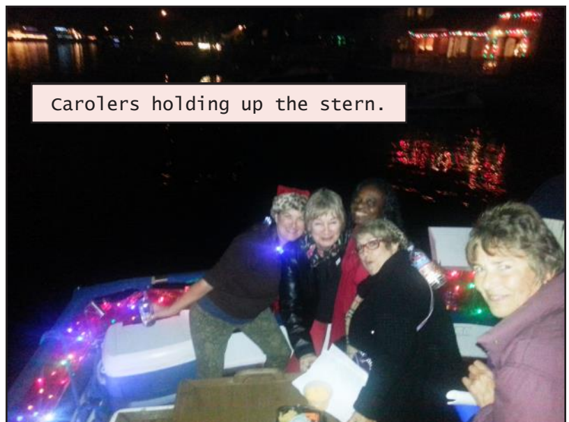
Carolers holding up the stern.