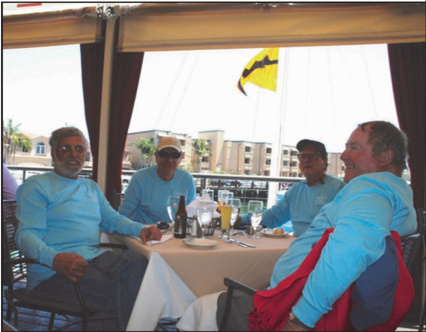
Battle flag at Cannery