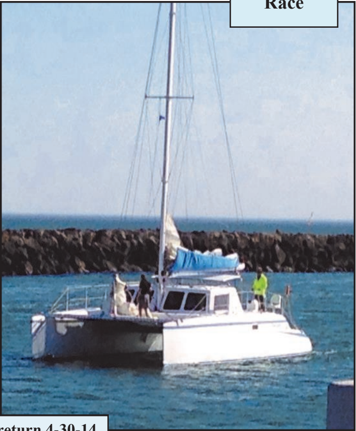
Ensenada return 4-30-14