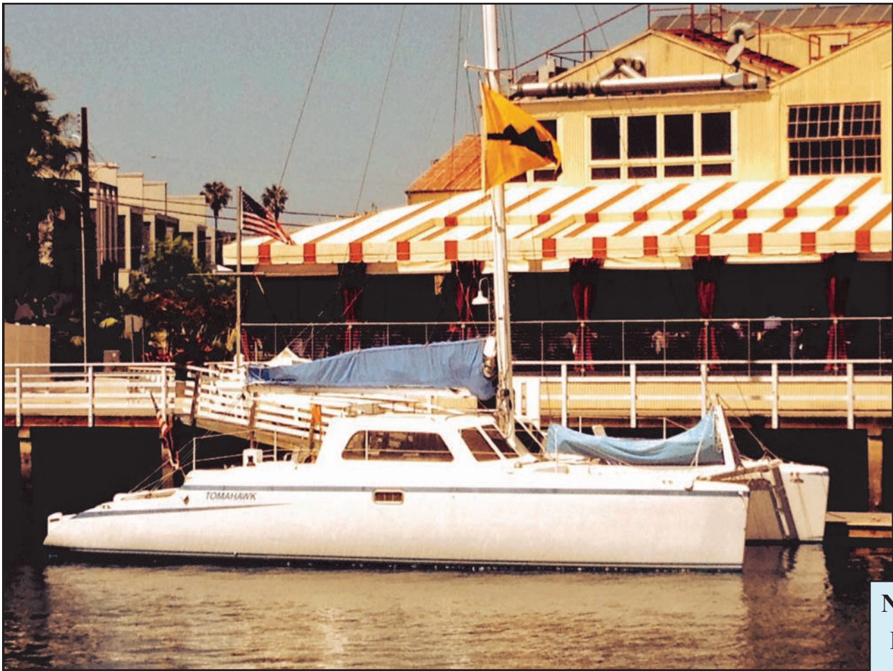
TOMAHAWK at Cannery 2