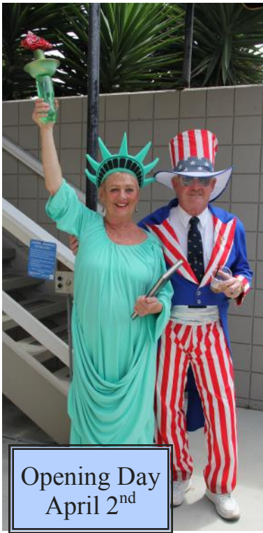
Opening Day April 2 nd