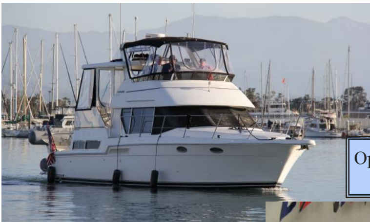
Opening Day April 2 nd