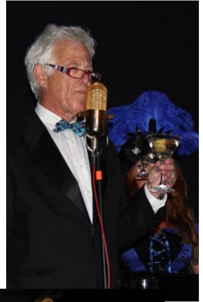
Variety Show April 7 th & 8 th