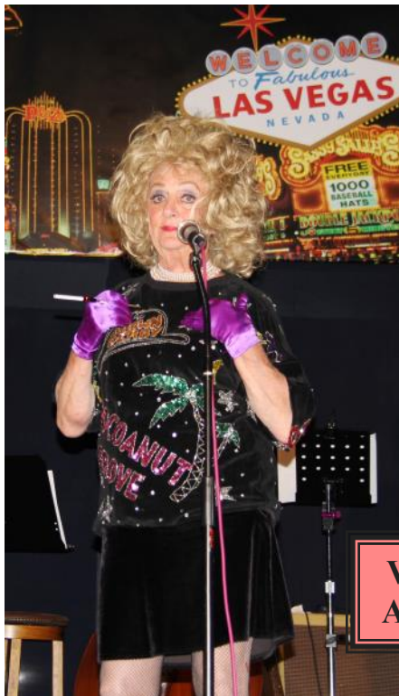
Variety Show April 7 th & 8 th