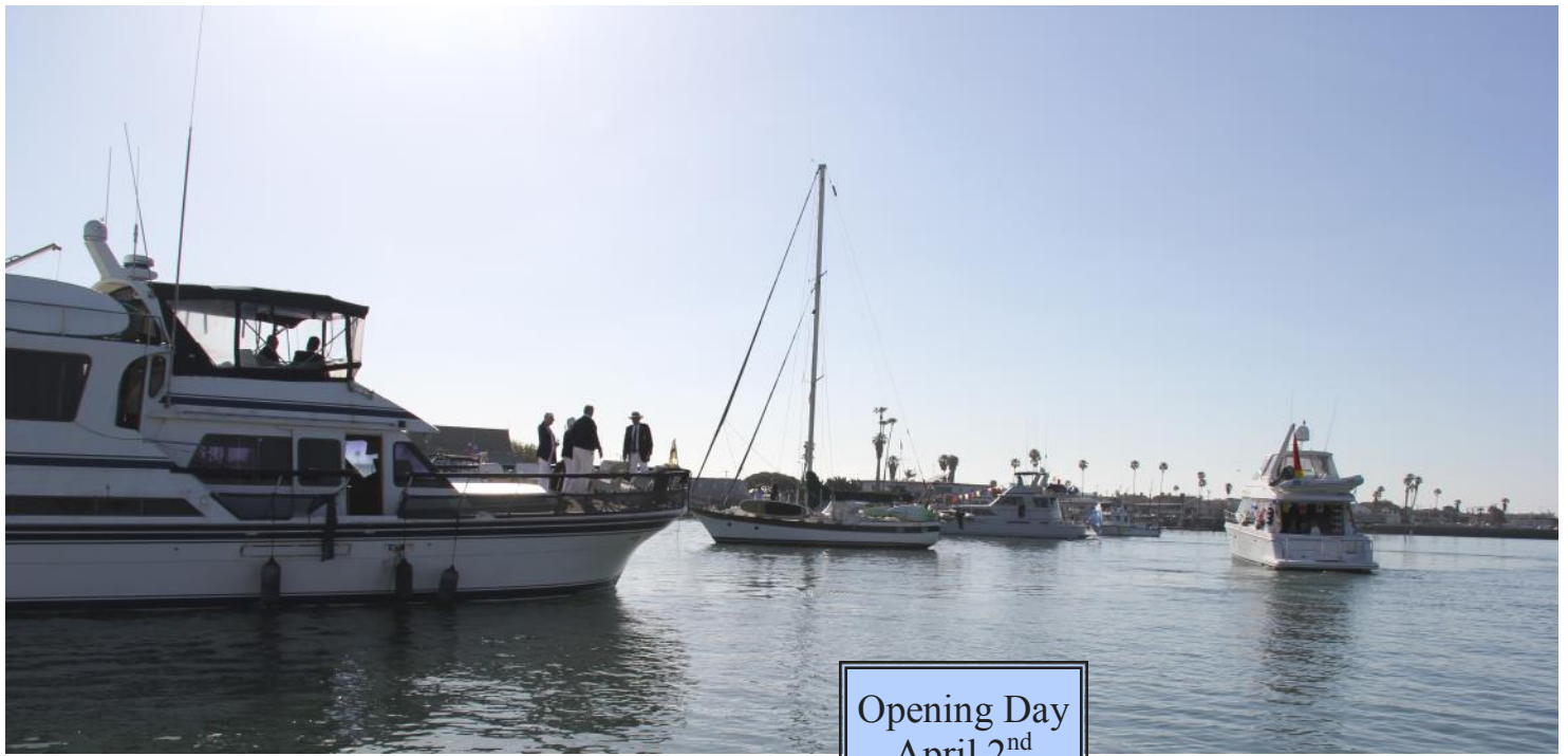
Opening Day April 2 nd