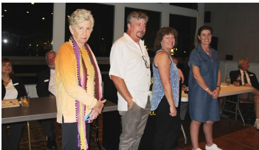
Recent New Members