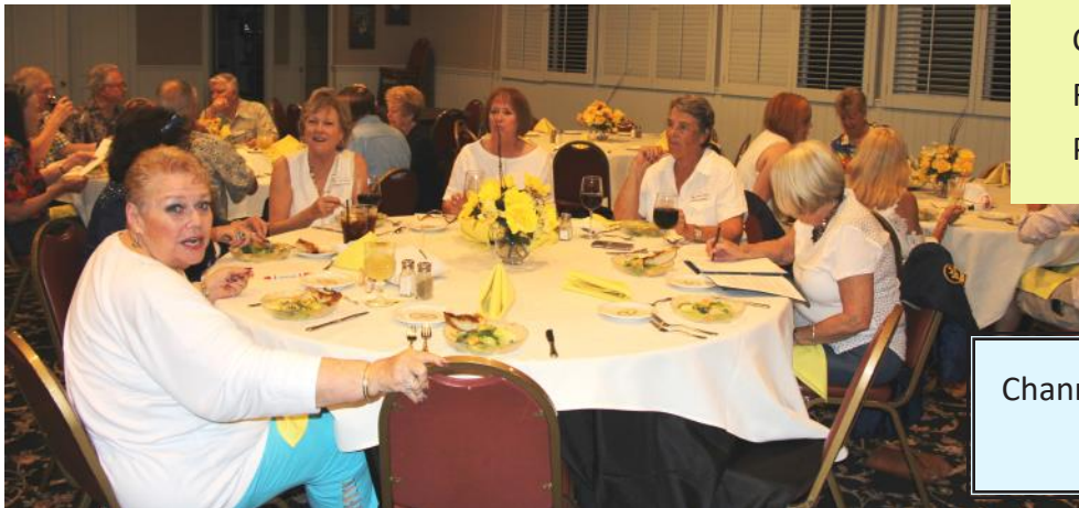
Channel Islanders Election Dinner October 26 th