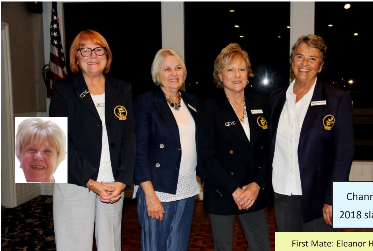
Channel Islanders 2018 slate of officers