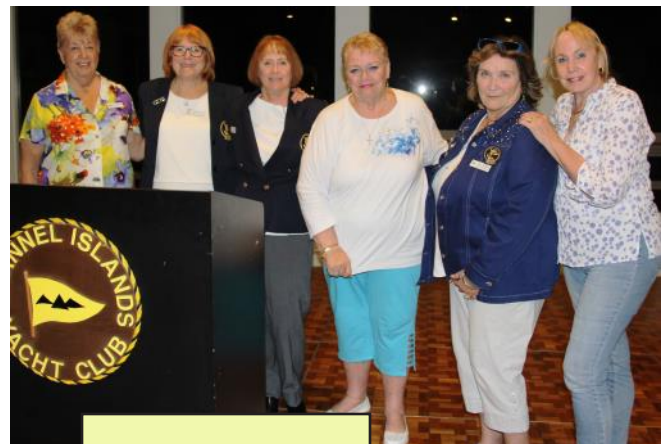
Prior First Mates