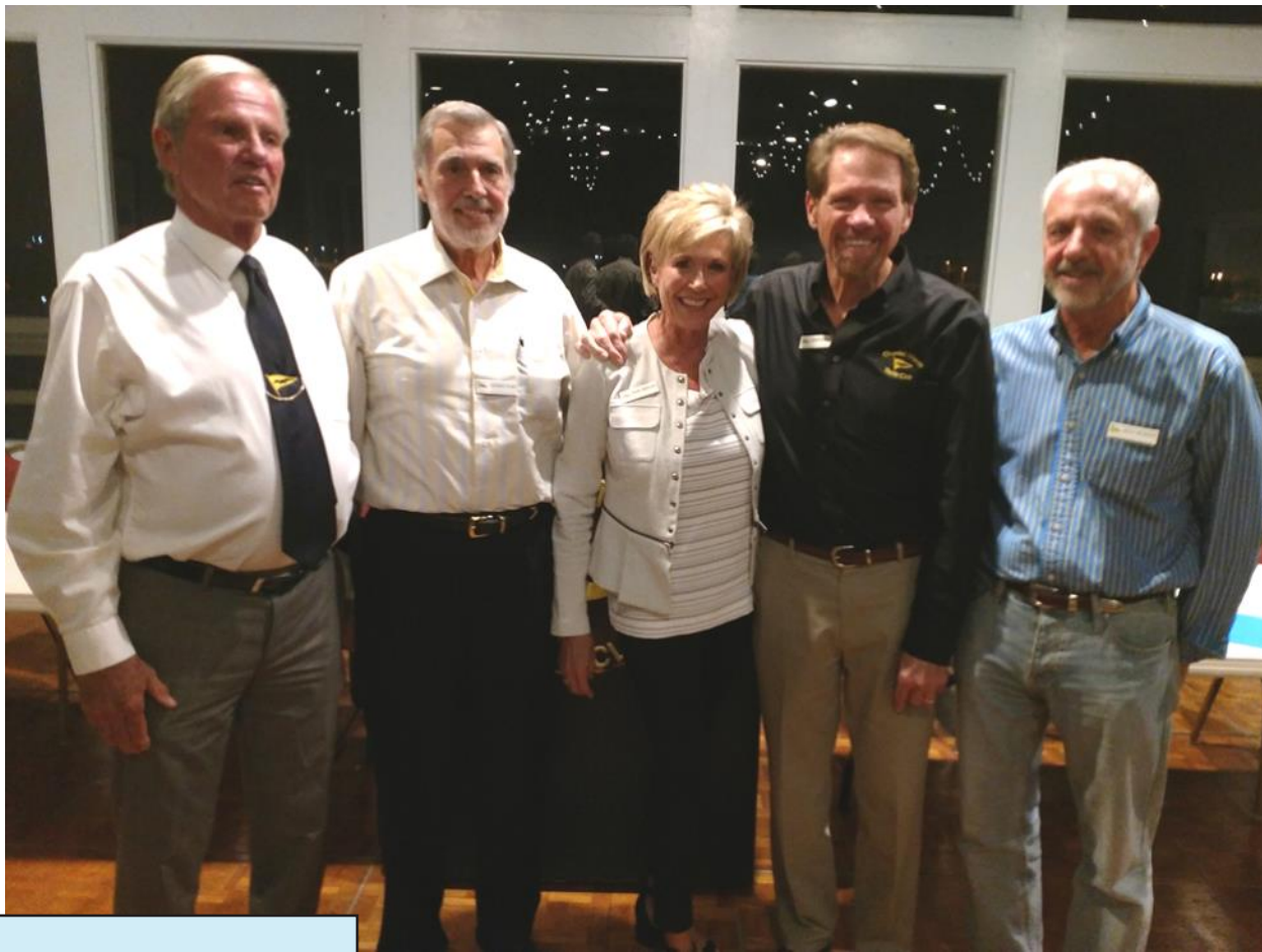
New Board of Directors