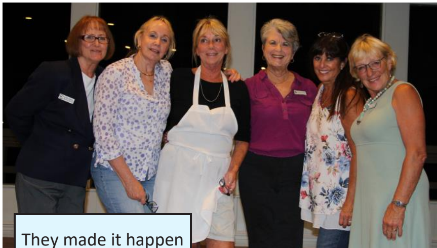
They made it happen