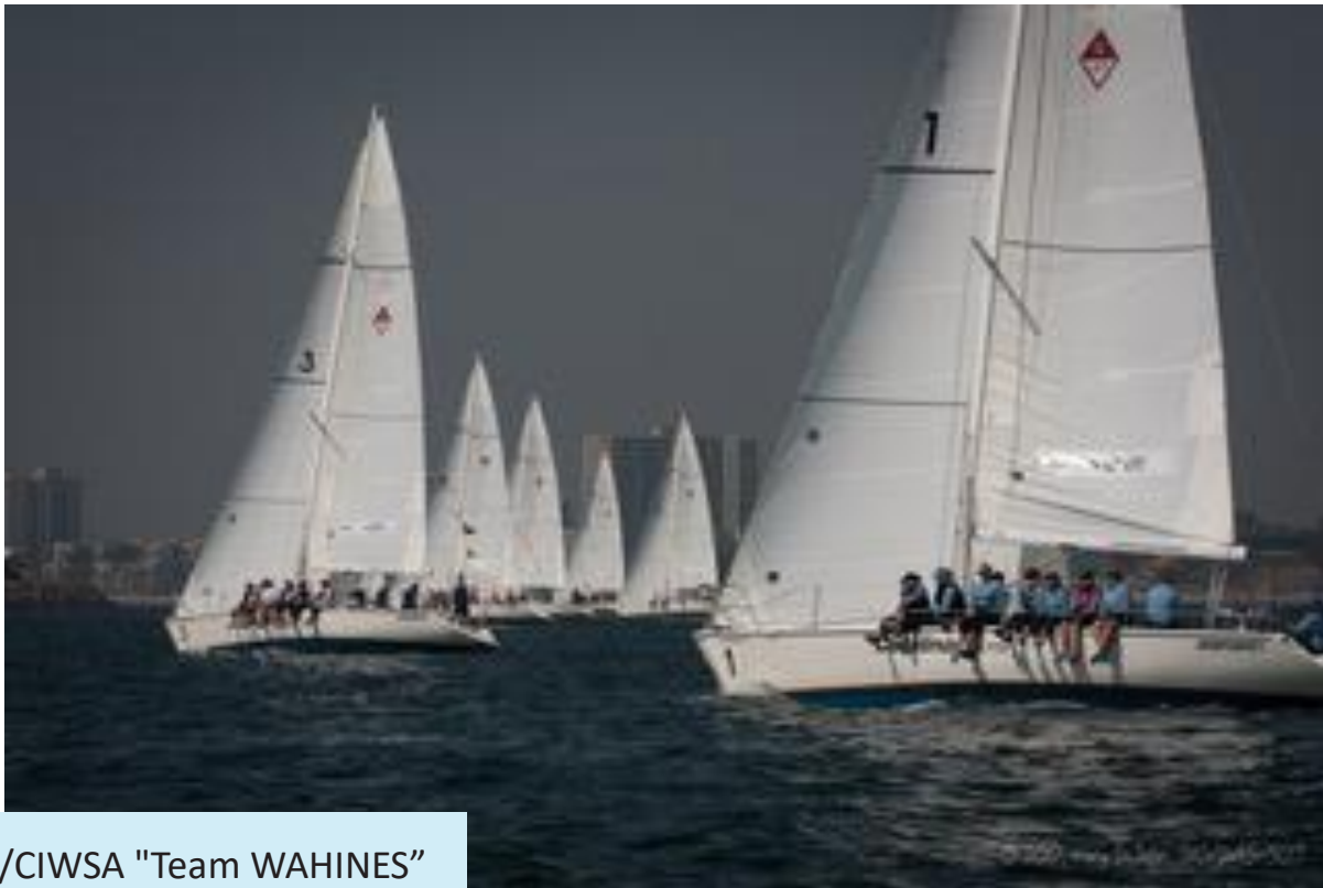
CIYC/CIWSA "Team WAHINES" All-Women LEMWOD Regatta Long Beach Yacht Club October 14-15, 2017