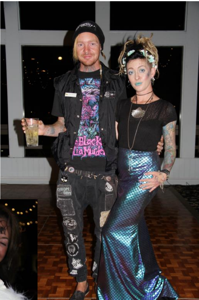
Hair Ball Social October 28th