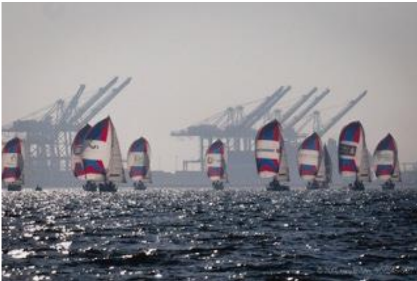
CIYC/CIWSA "Team WAHINES" All-Women LEMWOD Regatta Long Beach Yacht Club October 14-15, 2017