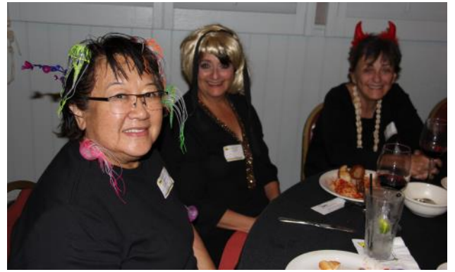
Hair Ball Social October 28th