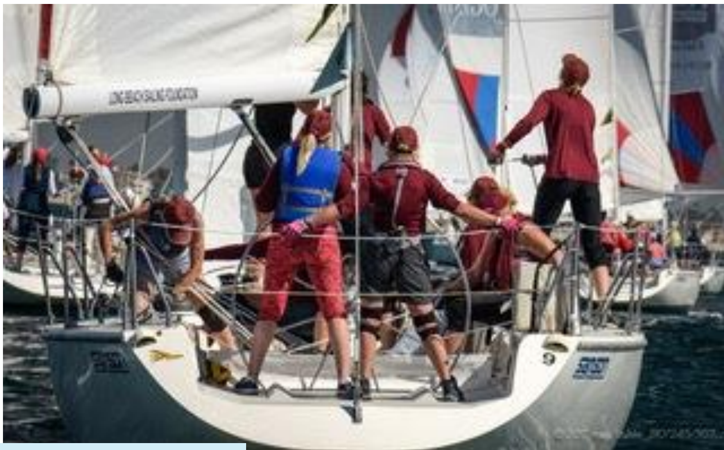
CIYC/CIWSA "Team WAHINES" All-Women LEMWOD Regatta Long Beach Yacht Club October 14-15, 2017