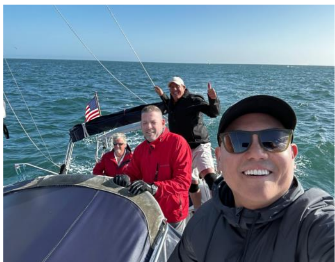
The SWIFT crew during the Anacapa Anyway race (L to R):