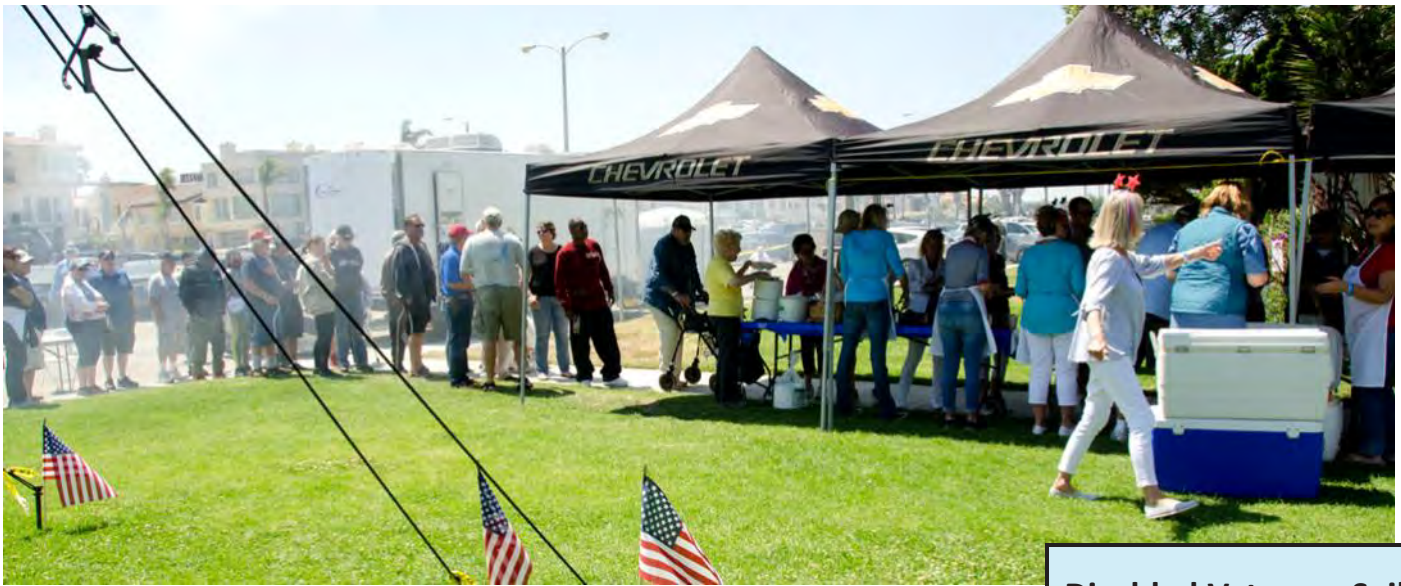
Disabled Veterans Sail Day Sunday, June 24 th