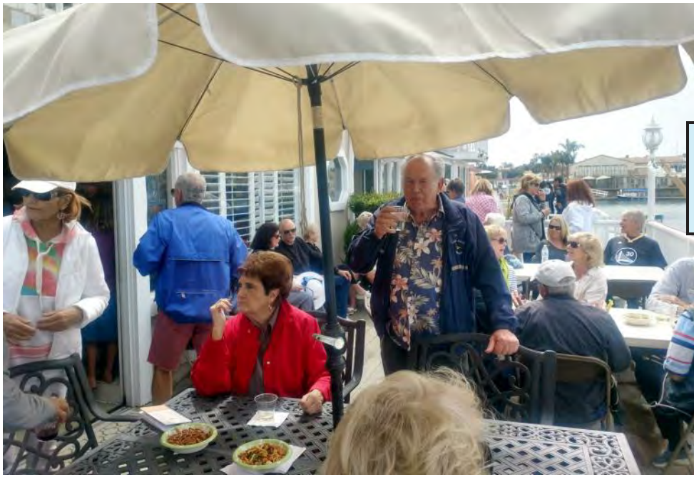
Electric Boat Event May 20th