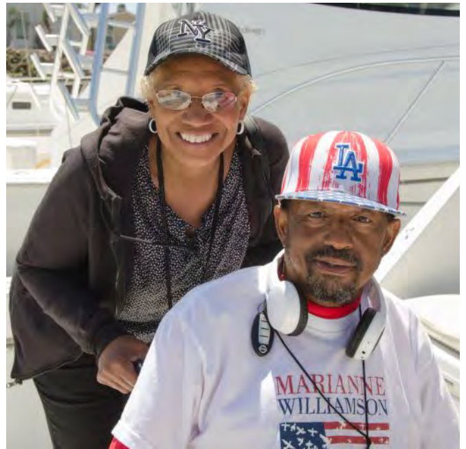
Disabled Veterans Sail Day Sunday, June 24 th