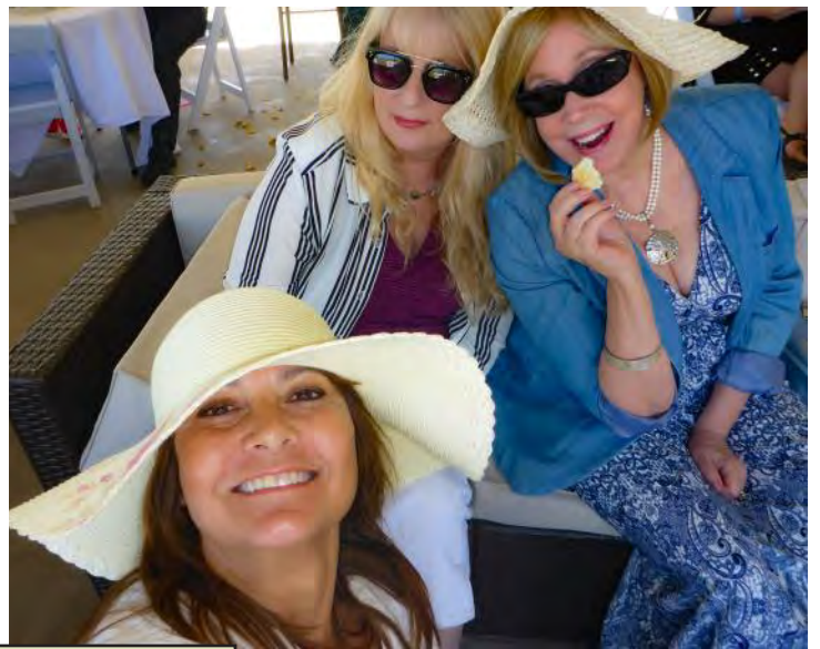
Santa Barbara Polo Match Sunday, May 20 th