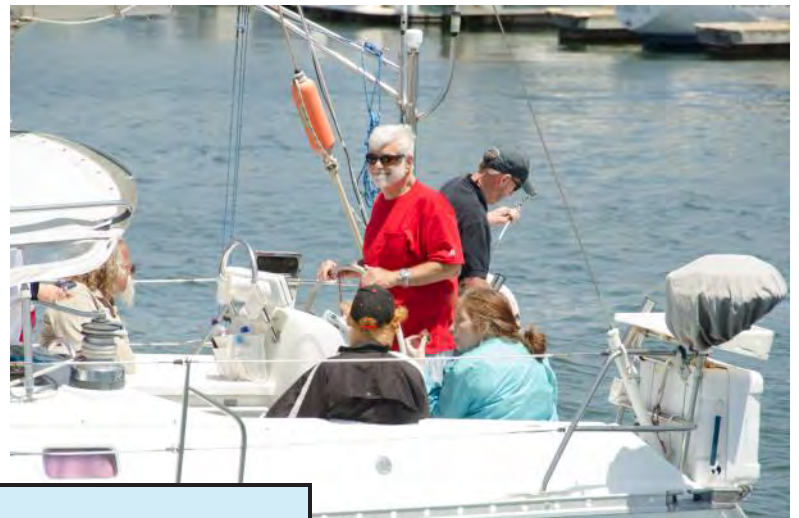
Disabled Veterans Sail Day Sunday, June 24 th