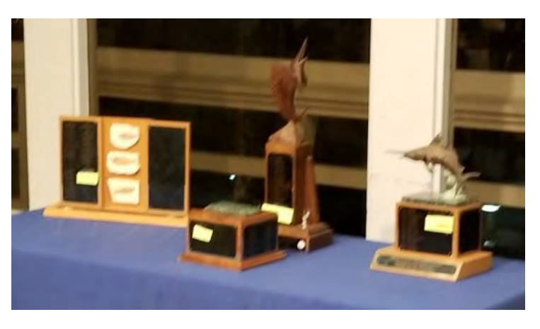
Anglers Awards Dinner Nov. 17<sup>th</sup>