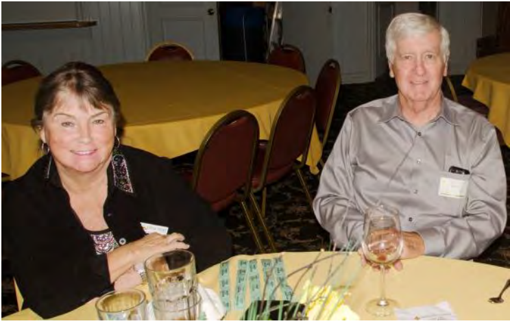
Islanders Election Dinner Nov. 16<sup>th</sup>