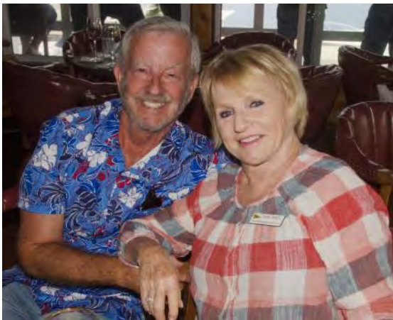
DAV Sail Day June 23 rd