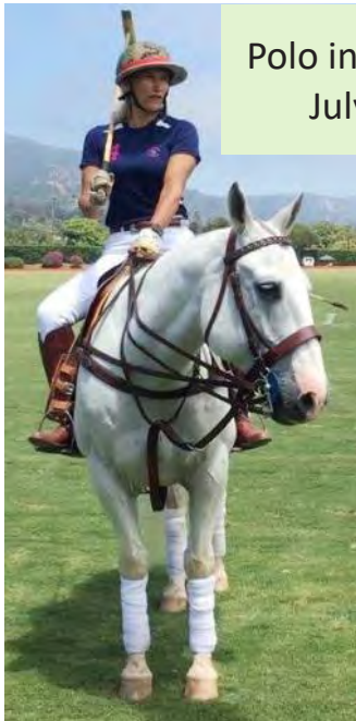
Polo in Paradise July 14 th