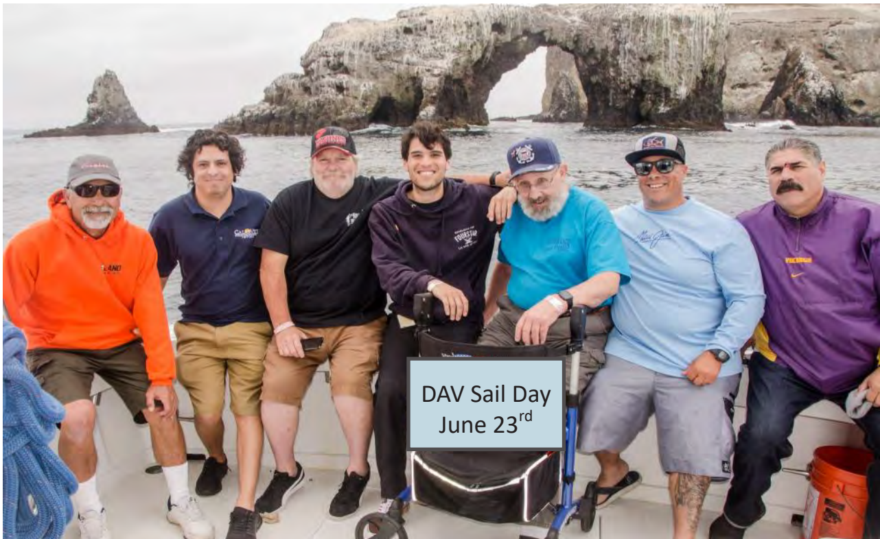
DAV Sail Day June 23 rd