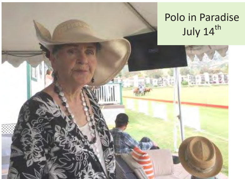
Polo in Paradise July 14 th