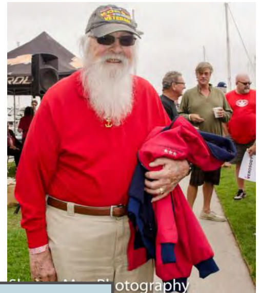
DAV Sail Day June 23 rd