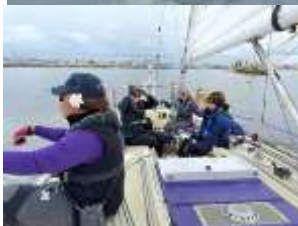
Wailani crew above*