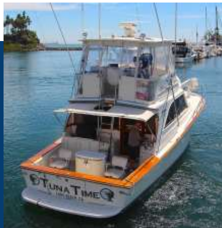
100 Ton Master Power and Sail