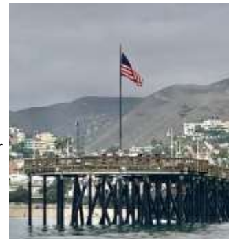
Ventura Pier -starboard end of the Sailathon start line

While the boats were sailing, nearly a dozen volunteers prepared their favorite chili or clam chowder recipes in crock pots. Upon arrival after the Sailathon, attendees sampled and voted for their favorites, and the top cooks were awarded with an invitation to make their respective chili and chowder for the next Caregivers event! Through a random drawing of "gold coins" purchased by attendees, a collection of high-value donated gifts from the "Treasure Chest" was dispersed. Skippers turned in their boat's lap records and donations, and several awards were given: Ugly Fish (AYC) for most boats from a single yacht club, Ca$h Me if You Can (VSC) for most money raised, and most laps completed (CIYC, CHRONIC, Lonnie Jarvis).