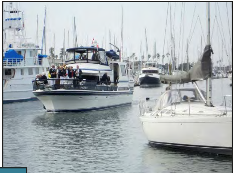
CIYC - Opening Day Parade - April 4