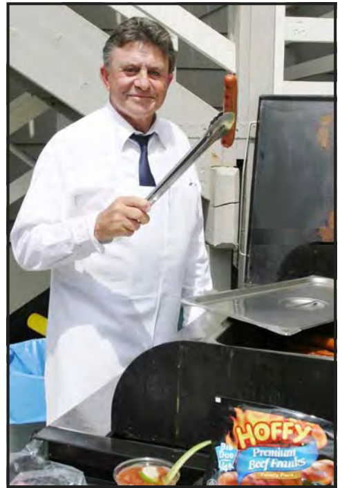
CIYC - Opening Day April 4