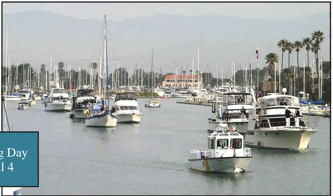
CIYC - Opening Day Parade - April 4