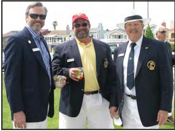
CIYC - Opening Day April 4