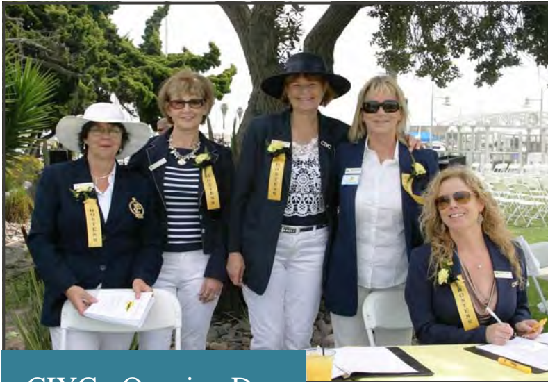
CIYC - Opening Day April 4