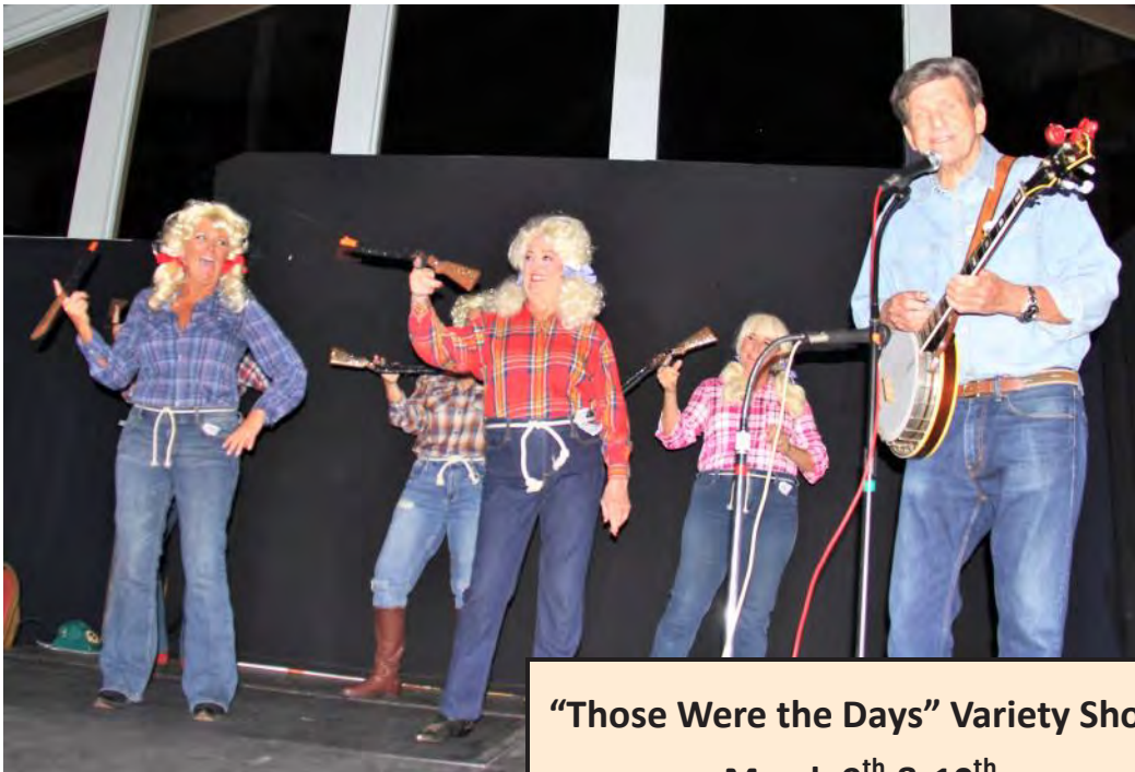
"Those Were the Days" Variety Show March 9 th & 10 th