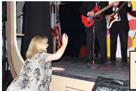
"Those Were the Days" Variety Show March 9 th & 10 th