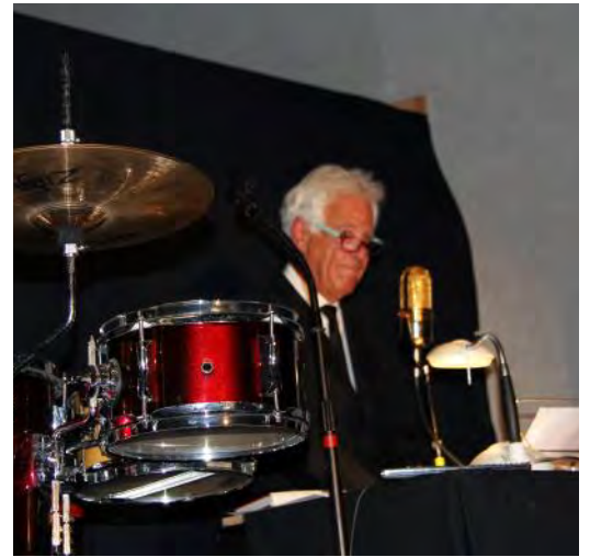
"Those Were the Days" Variety Show March 9 th & 10 th