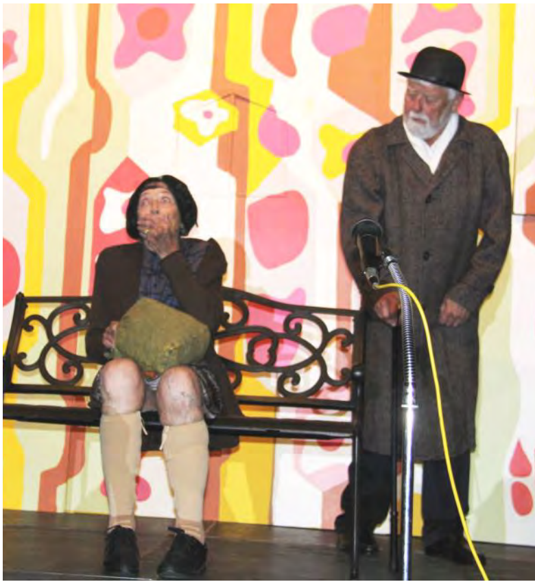
"Those Were the Days" Variety Show March 9 th & 10 th