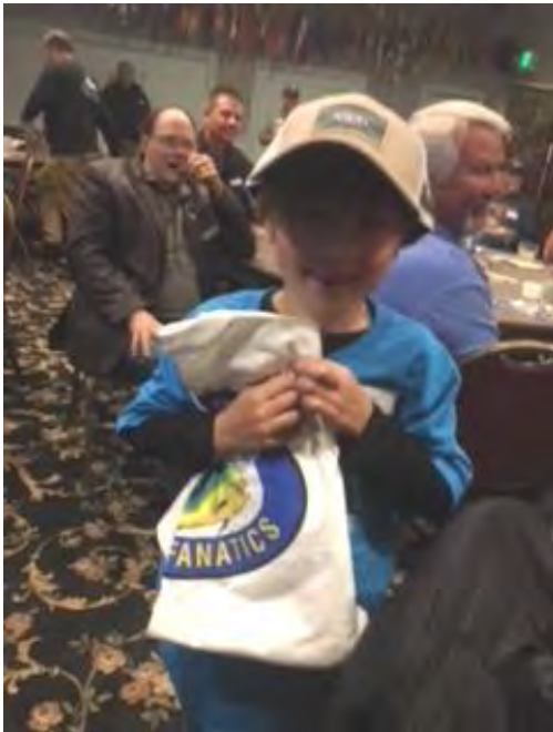
CCA Quarterly meeting and Rockfish seminar March 19 th