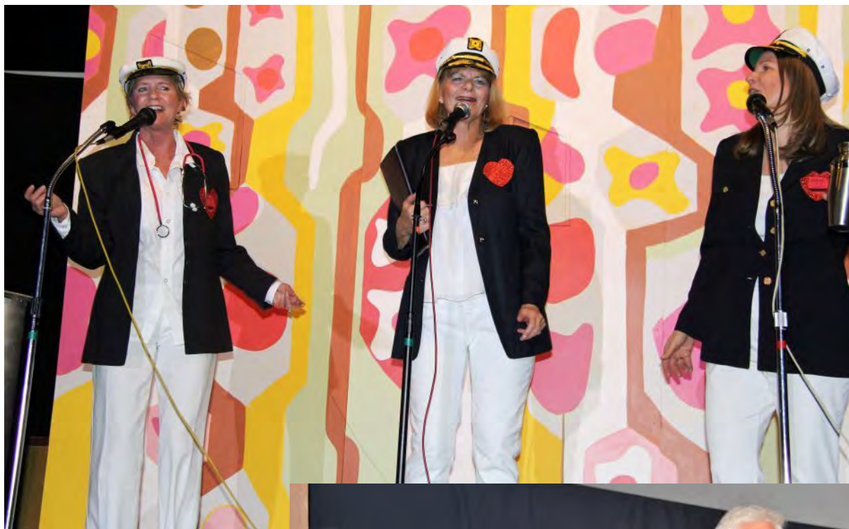
"Those Were the Days" Variety Show March 9 th & 10 th