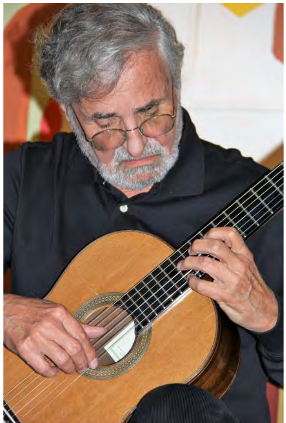
"Those Were the Days" Variety Show March 9 th & 10 th