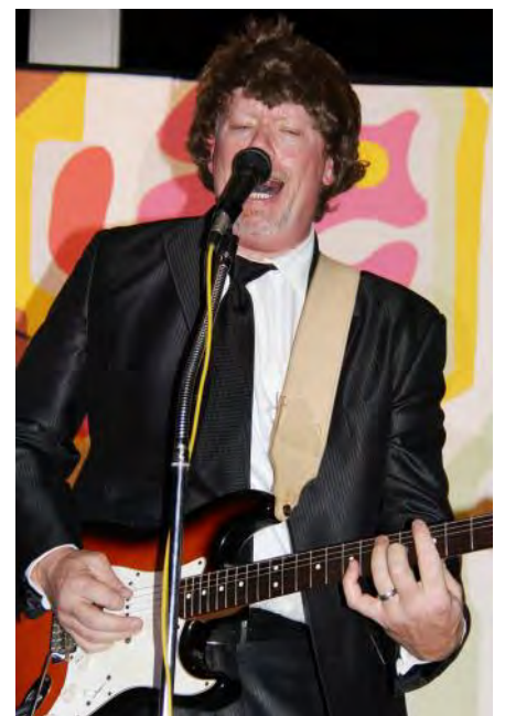
"Those Were the Days" Variety Show March 9 th & 10 th