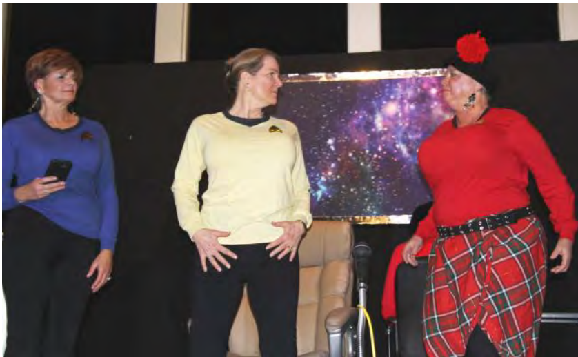
“Those Were the Days” Variety Show March 9 th & 10 th