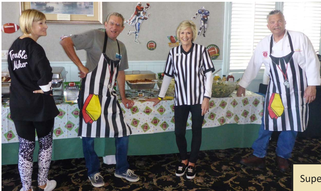
Super Bowl Party February 4 th