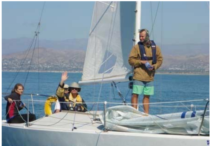
2018 CIYC Mid Winter Race February 17 th & 18 th