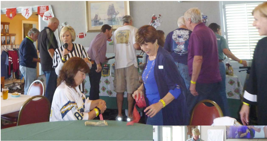
Super Bowl Party February 4 th