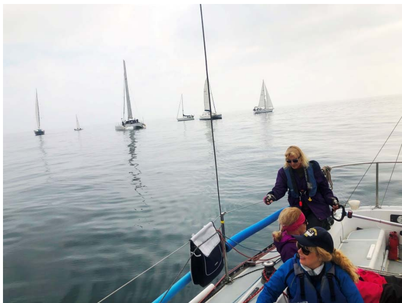
The fleet waited for wind for 2 hours before the start.